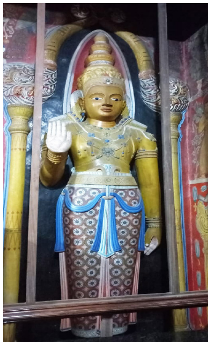
Pl.4 - Natha statue (2) of Sapugaskanda Rajamaha Vihara