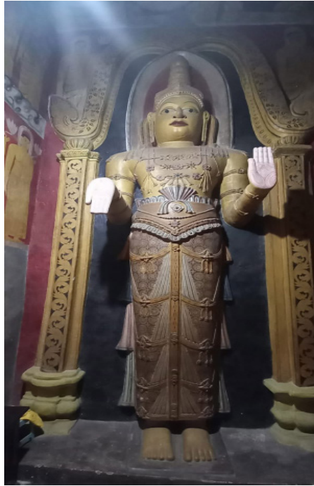
Pl.3 - Natha statue (1) of Sapugaskanda Rajamaha Vihara