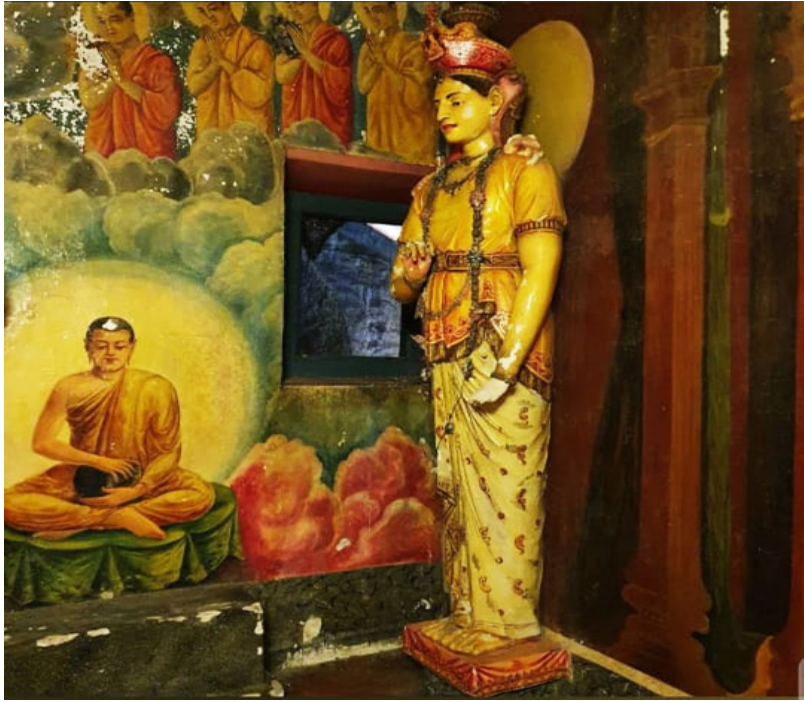
Pl 05. - Natha statue - Waboda Purana Gallen Rajamaha viharaya (19th Century)